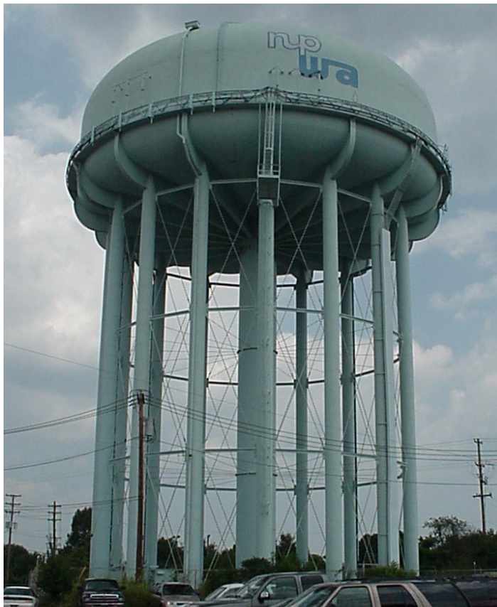
Elevated tank in the North Penn system.

Operating costs over the 30 year planning horizon amounted to $27.56 million for pumping at the water treatment plant, pump stations and wells. NPWA later estimated that the optimized solution will save them 25% in capital costs alone, compared to their previous capital facilities planning.